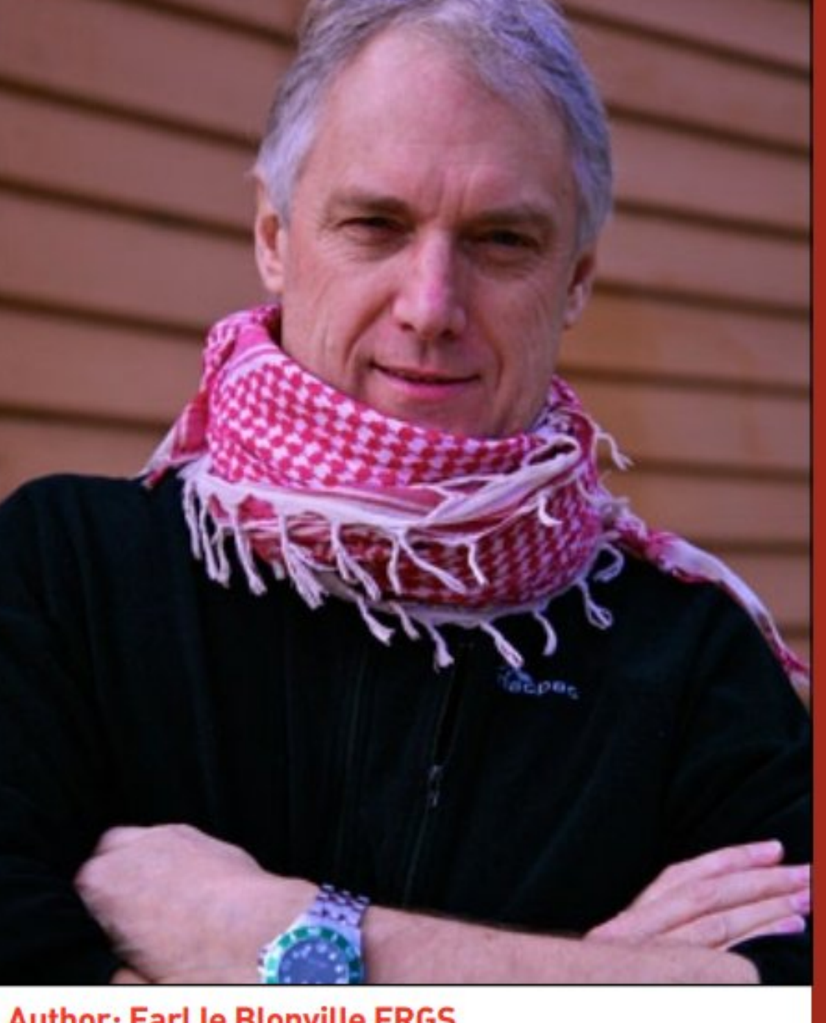
Author: Earl de Blonville FRGS

'A masterpiece of exploration by a poet of action' - Bill Green, Multi-award winning novelist. Screenwriter: 'Terminator 2'