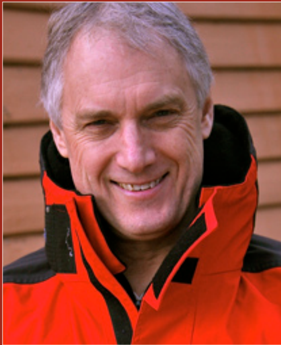
Earl de Blonville FRGS Arctic explorer and leader of Arctic 2011

Please join me for an inspiring evening of Arctic Cocktails, Polar Rations, exploration plans and the chance to meet some of Australia's greatest adventurers and inspirational leaders.